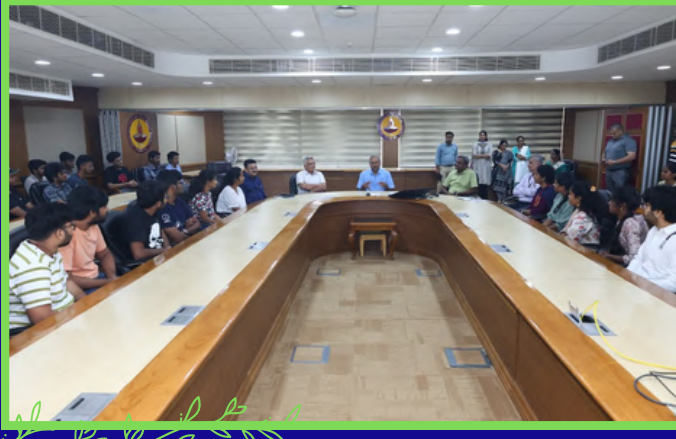
Interaction with Ram Shriram Scholars - B.Tech and Online Students