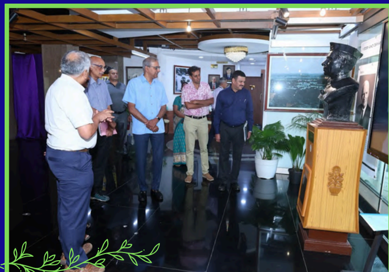
Visit to the Heritage Centre, IIT Madras