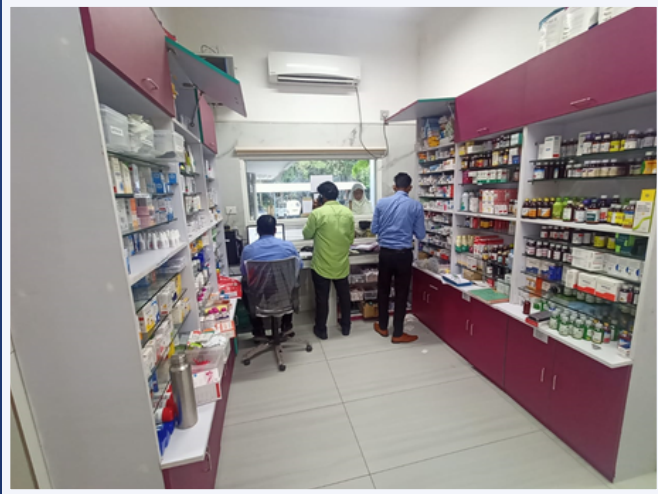
PHARMACY (GROUND FLOOR - FRONT WING)