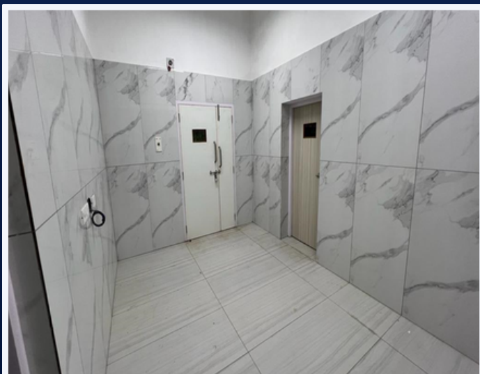
FEVER CLINIC (GROUND FLOOR - FRONT WING)