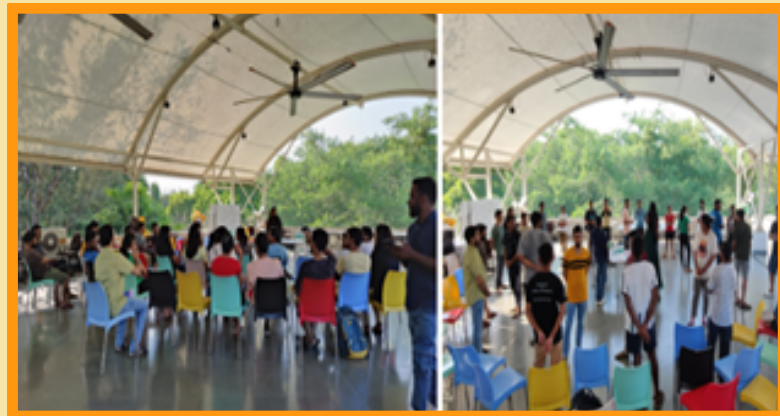
Student Well being Lectures