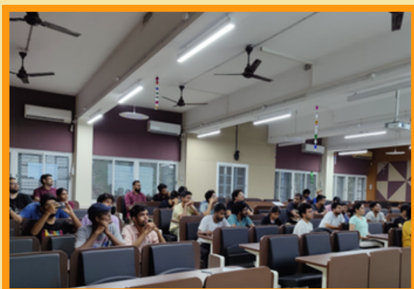
WELLNESS CIRCLE - PHYSICS DEPT