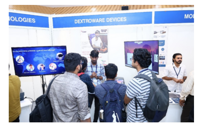
GDC Startups Showcase