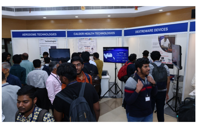
Visitors at the Startup Showcase