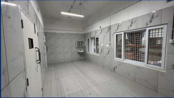
Record rooms – 2 nos. (Ground floor – Front Wing)