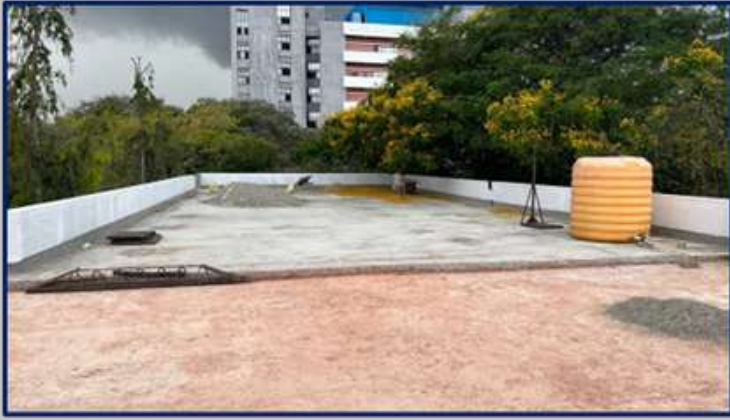
First Floor - Roof Slab