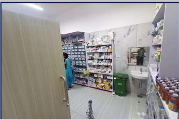
Two rooms for Distribution & One Store room