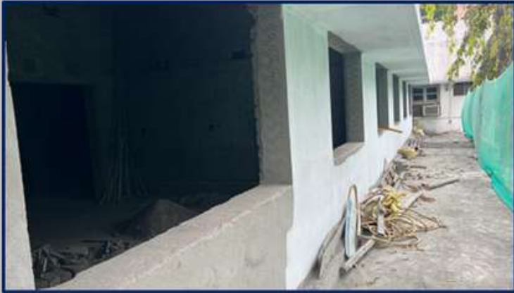
First Floor - Front View