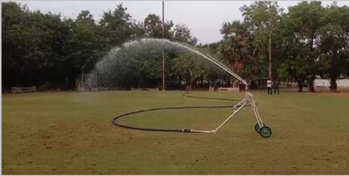
Setting up a Rain gun at KV ground