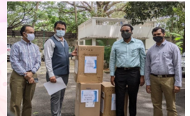
Contributed 200 oxygen concentrators (5 litres each) to the Government of Telangana & Karnataka