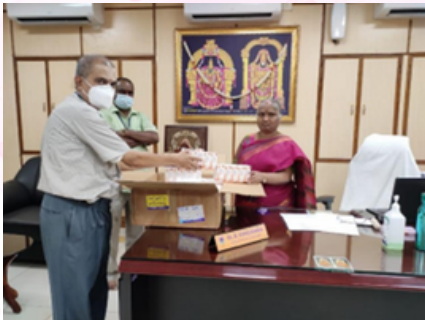
Contributed 1000 units of covid medicines to Sri Venkateswara Institute of Medical Science (SVIMS), Chittoor

Provided healthy meals to students who were stranded during covid pandemic with the help of a nutritionist. Arrangements were made to serve paneer, banana, and eggs as optional extras