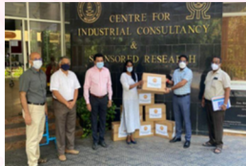
Donated BiPAP units, Injections and medicines