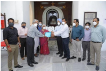
IIT Madras handed over 200 oxygen concentrators to the Government of Tamil Nadu