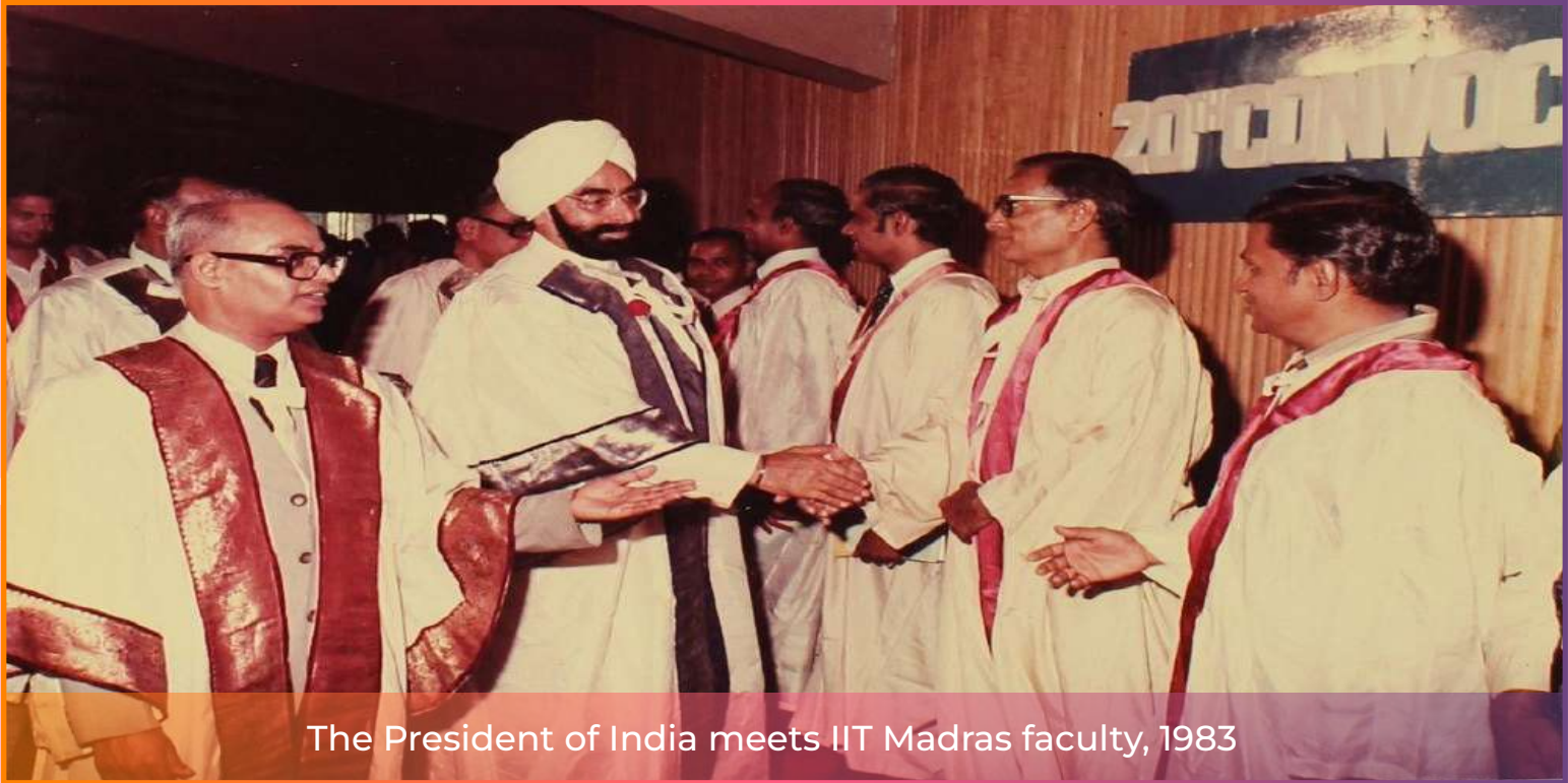
The President of India meets IIT Madras faculty, 1983