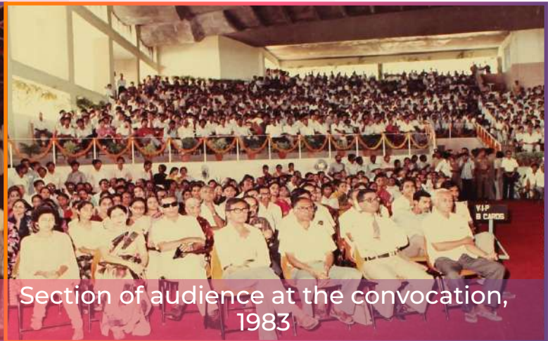
Section of audience at the convocation, 1983