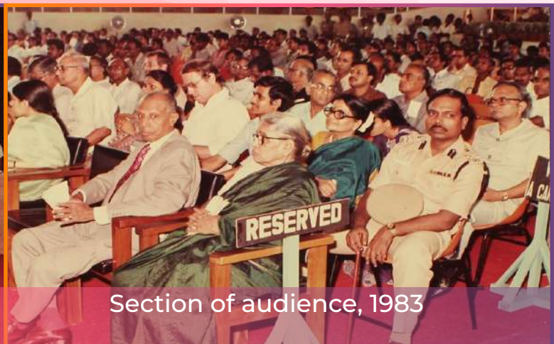
Section of audience, 1983