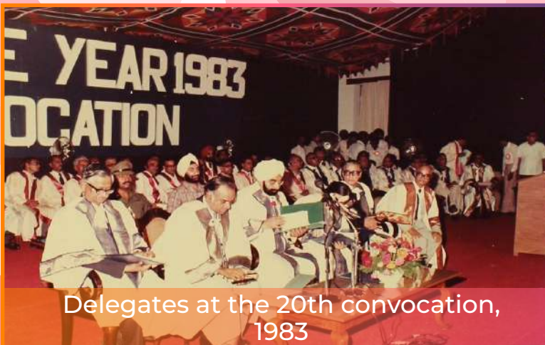
Delegates at the 20th convocation, 1983