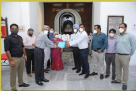
Donated BiPAP units, Injections and medicines