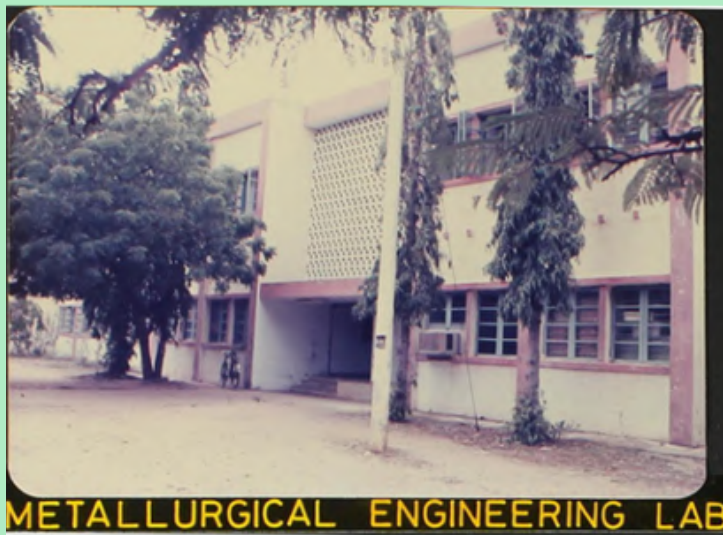
Metallurgical Engineering Lab