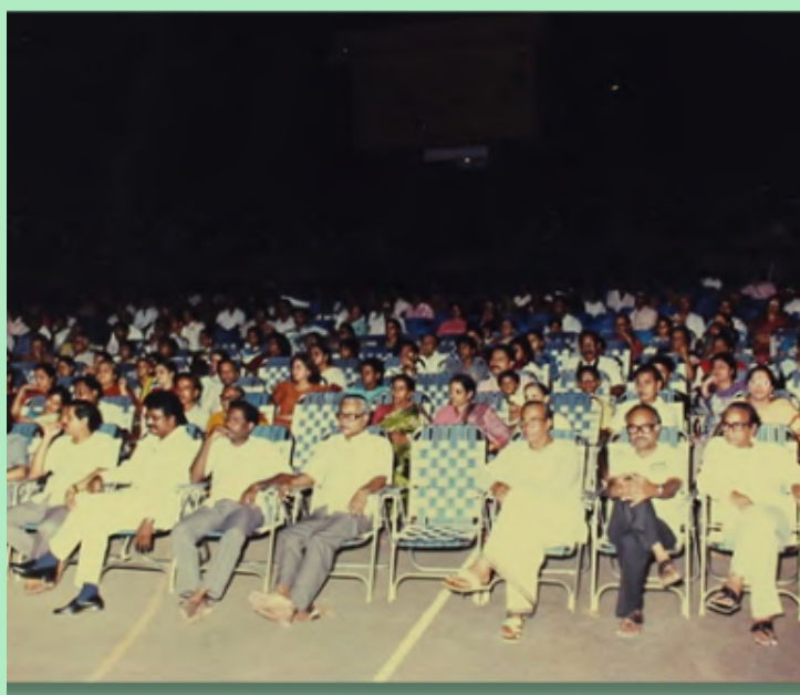
Open Air Theatre in 1992