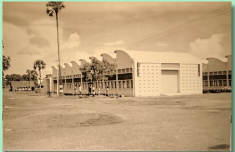
Central Workshop in early times