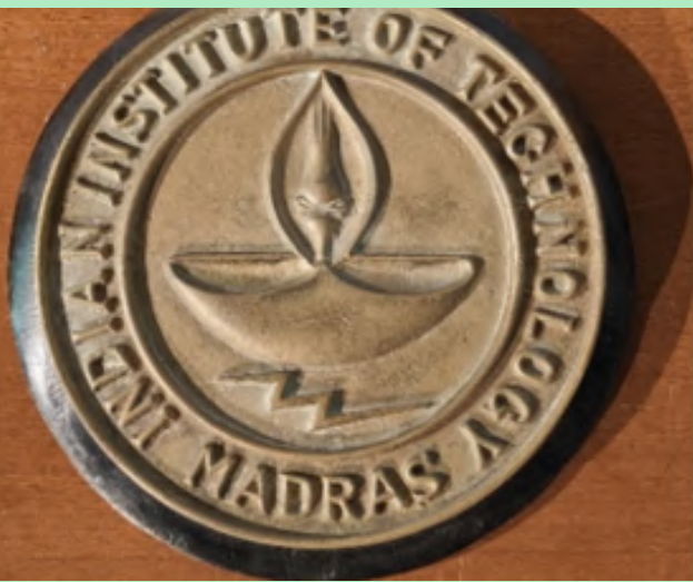
IIT Madras emblem from early years of establishment