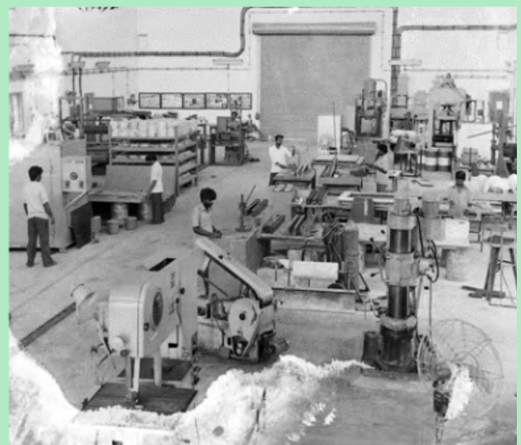
FRP Centre during early days