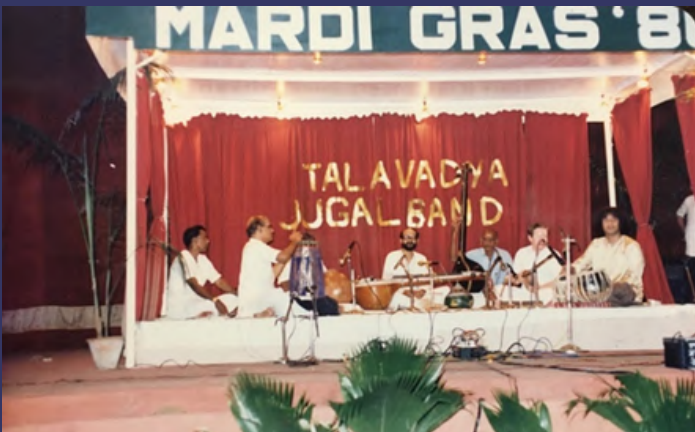
A live performance at Mardi Gras during 1986