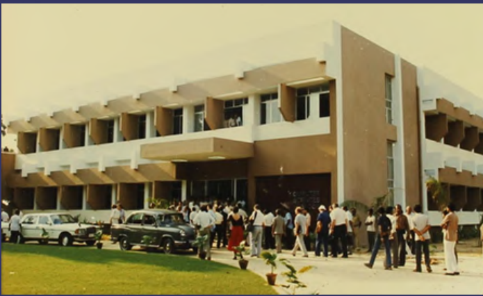
Computer Science block in 1980s