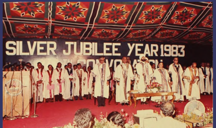
Silver Jubilee Year 1983