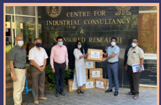
Donated BiPAP units, Injections and medicines