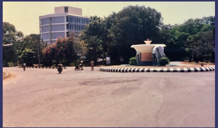
Gajendra Circle and the Admin Building in 1980s