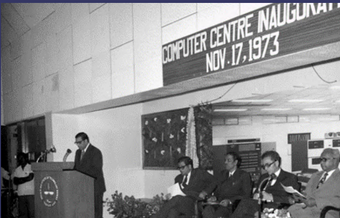
Inauguration of the Computer Centre in 1973