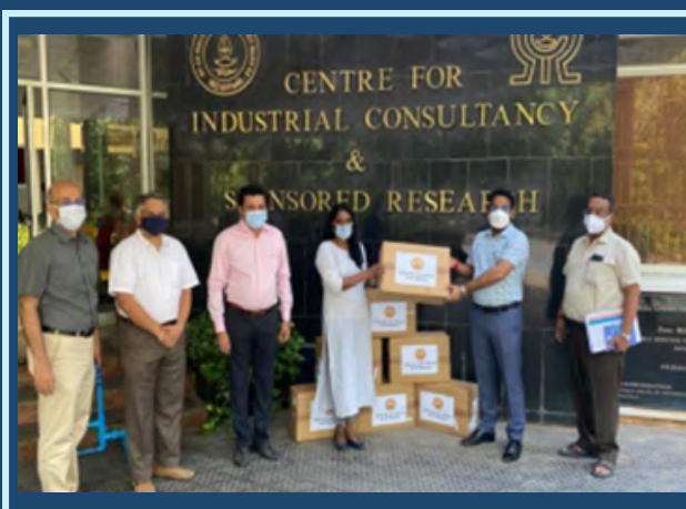
Donated BiPAP units, Injections and medicines