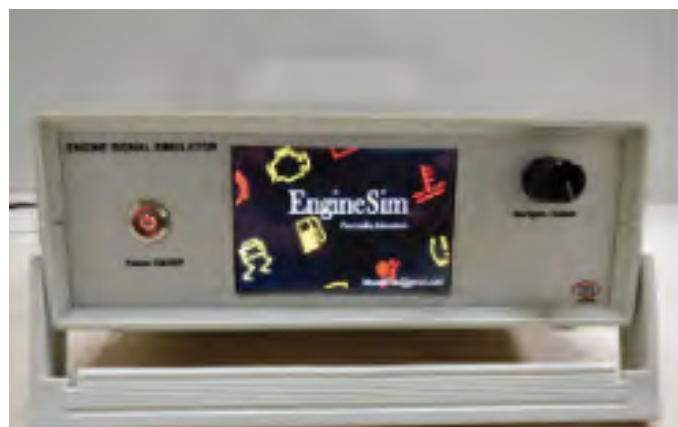
● Dbyt Dynamics