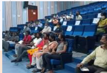
Inclusivity in the workplace workshop among the employees