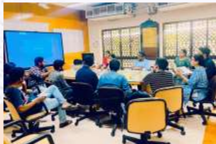
The Student Wellness team's meeting with the students