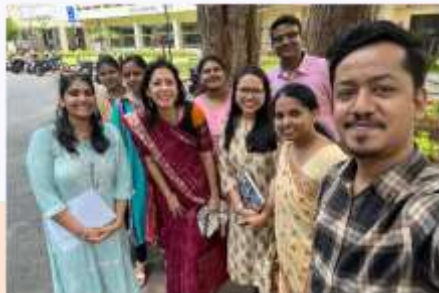
Recently Nimhans team visited our institute and gave us suggestions on how to improve students' mental health.