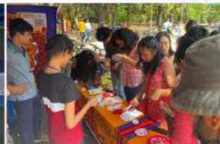
Sarang stall, we met more than 500 people every day. We played mental health related games, launched activities, and gave them mental health related gifts.

FOR MORE DETAILS ABOUT WELLNESS COMMUNITY CENTRE