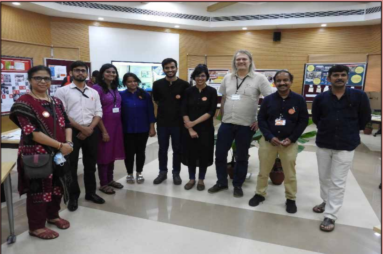
Heritage Centre Team and Archive Team, IIT Madras