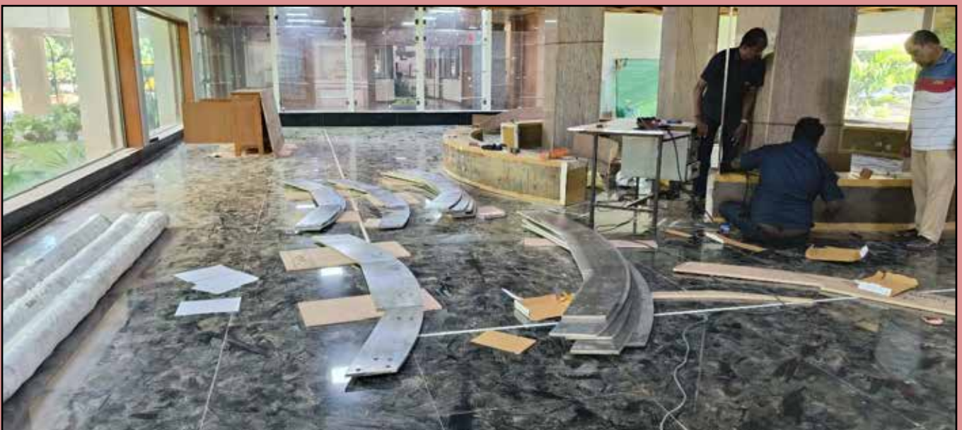
Central dome work