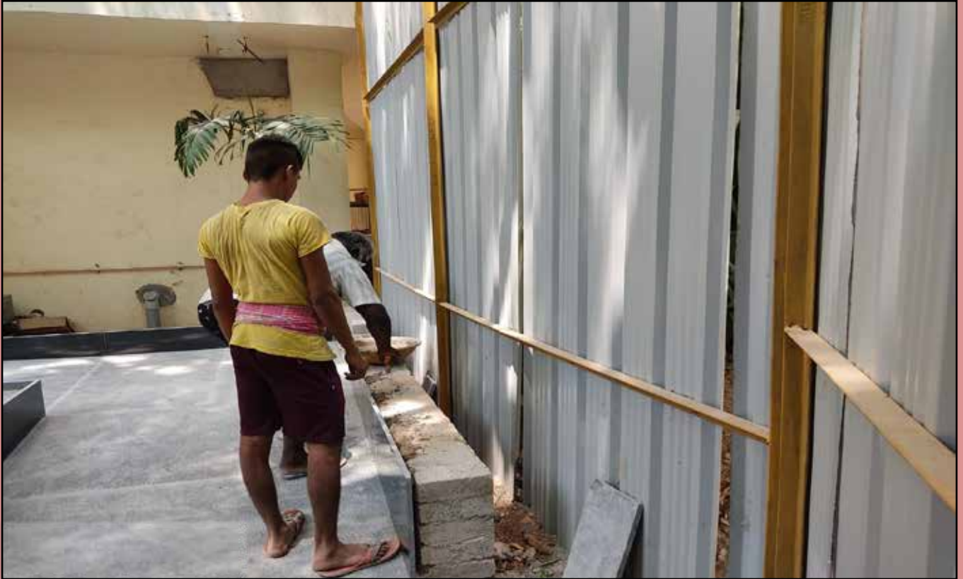
Entrance of the Heritage Centre