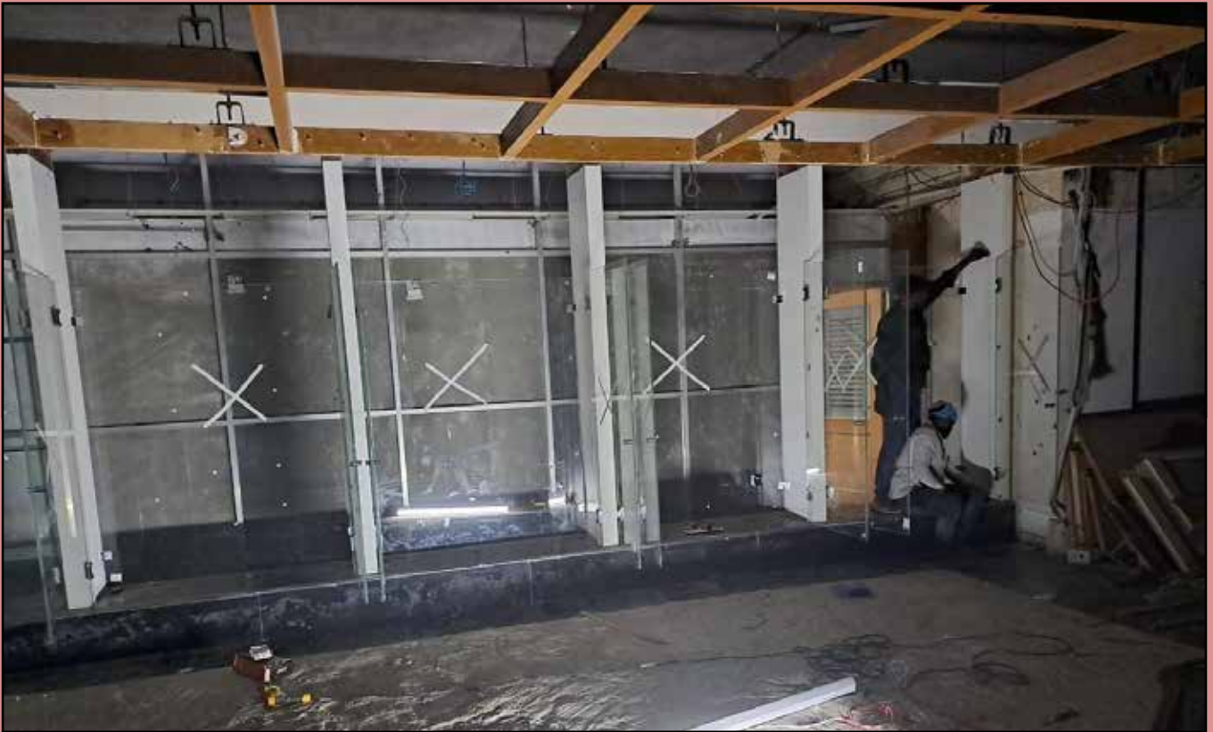
Glass display towards the entrance of the Administration building

Renovation works are currently being carried out at the Heritage Center to accommodate the expanding collection of items. The work that was started in January 2022 is estimated to be completed by December 2022.