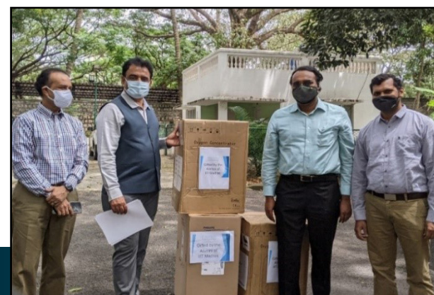
IIT Madras in coordination with IITM Alumni Association has contributed 200 oxygen concentrators (10 litre capacity) to Government of Karnataka