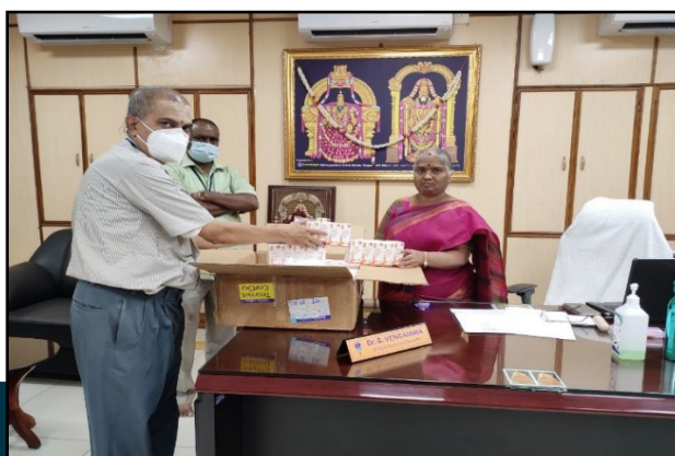
IIT Madras has contributed 1000 units of COVID19 medicines to Sri Venkateswara Institute of Medical Science (SVIMS), Chittoor